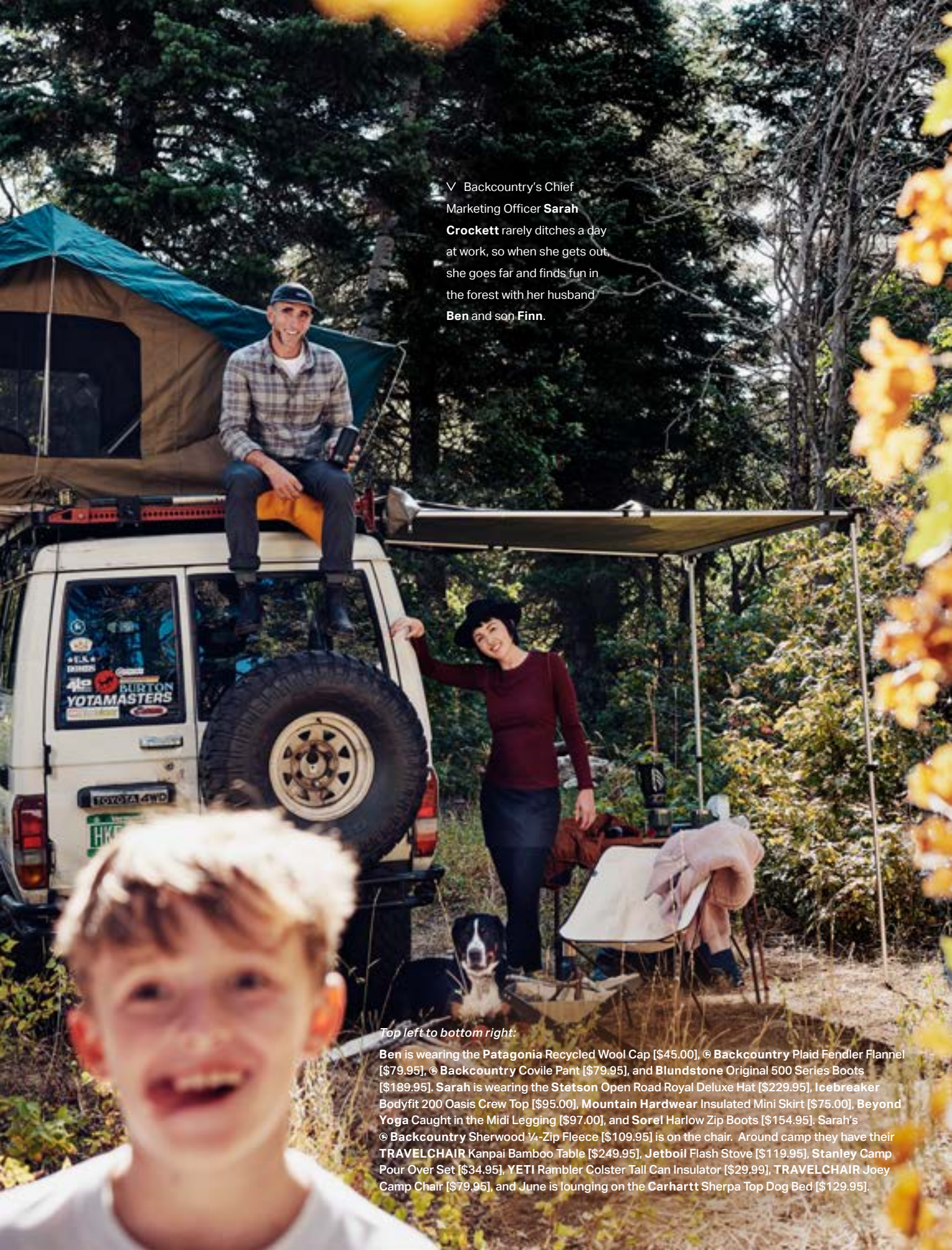
Top left to bottom right: