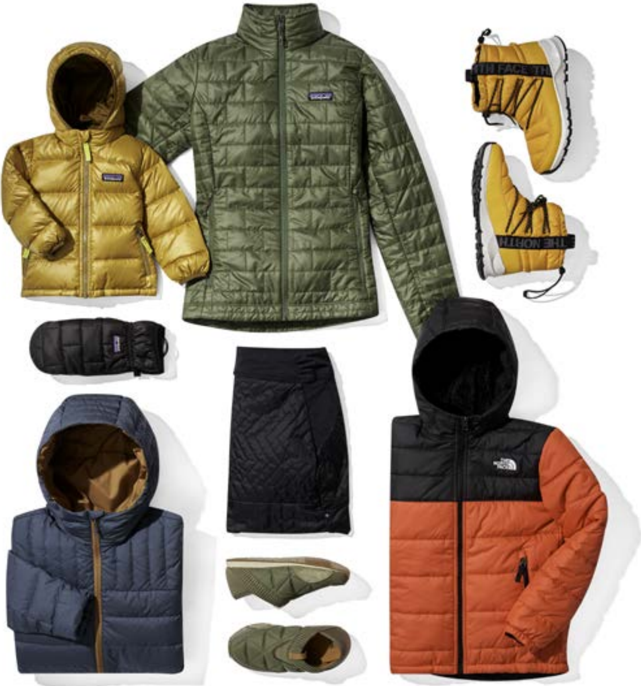
Clockwise from top left: Toddlers' Patagonia Hi-Loft Down Sweater Hoodie [$129.00], Patagonia Nano Puff Insulated Jacket [$199.00], The North Face ThermoBall Lace Up Boot [$109.95], Kids' The North Face Reversible Hoodie [$129.95], Mountain Hardwear Insulated Skirt [$75.00], Teva Ember Moc Shoe [$74.95], Backcountry Stansbury Down Hooded Jacket [$249.95], Patagonia Nano Puff Mitts [$69.00].

Ben is wearing the Patagonia Recycled Wool Cap [$45.00], Backcountry Plaid Fendler Flannel [$79.95], Backcountry Covile Pant [$79.95], and Blundstone Original 500 Series Boots [$189.95]. Sarah is wearing the Stetson Open Road Royal Deluxe Hat [$229.95], Icebreaker Bodyfit 200 Oasis Crew Top [$95.00], Mountain Hardwear Insulated Mini Skirt [$75.00], Beyond Yoga Caught in the Midi Legging [$97.00], and Sorel Harlow Zip Boots [$154.95]. Sarah's Backcountry Sherwood 1/4-Zip Fleece [$109.95] is on the chair. Around camp they have their TRAVELCHAIR Kanpai Bamboo Table [$249.95], Jetboil Flash Stove [$119.95], Stanley Camp Pour Over Set [$34.95], YETI Rambler Colster Tall Can Insulator [$29.99], TRAVELCHAIR Joey Camp Chair [$79.95], and June is lounging on the Carhartt Sherpa Top Dog Bed [$129.95].